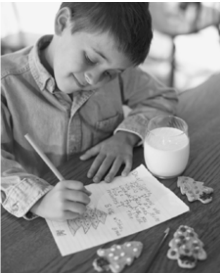
By Simone Castello

You can pick up more tips from www.christmasonabudget.co.uk or the excellent consumer site www.moneysavingexpert.com .