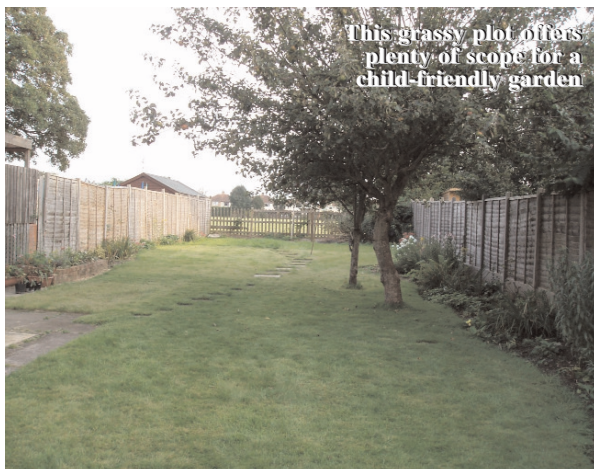
This grassy plot offers plenty of scope for a child-friendly garden

You can even use software - many free programs are available on the